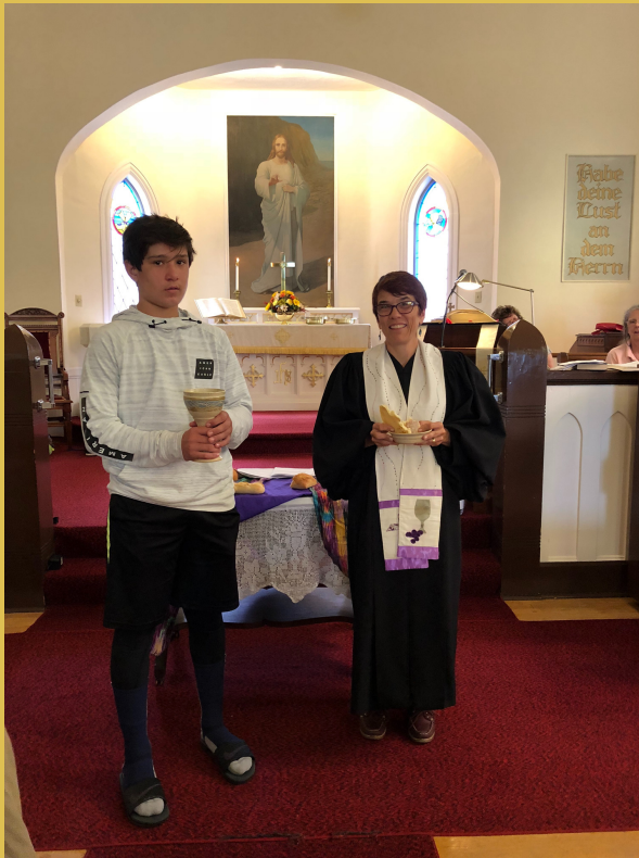
Serving Communion - October 2018

Mark your calendar and let your voice be heard!