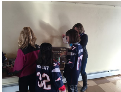
Souper Bowl of Caring